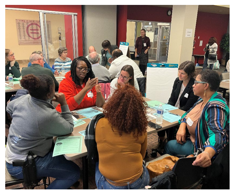
A group discusses how the Alliant Energy Center can better establish connections with South Side institutions and investments