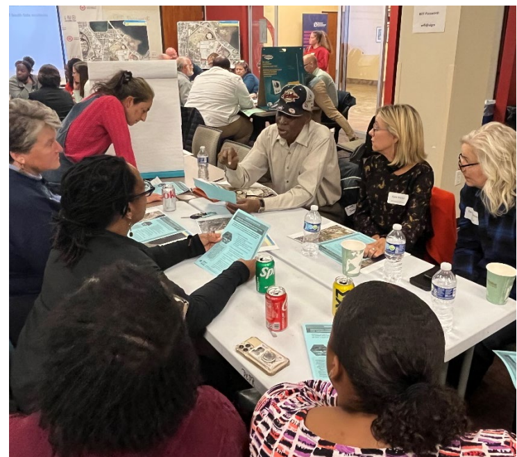
▲ A group discusses how the Alliant Energy Center can better meet the needs of South Side residents and underrecognized communities